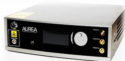
Option: the "all-in-one" laser system with fiber output

Connected with a DVI cable, the control unit manages the laser head. Optional 2-channels, 3-channels, and 4-channels control unit allows synchronously or asynchronously respectively 2-, 3-, 4-independent picosecond laser heads. The Control unit is managed either by the user with the touch-screen LCD display or by a Personal Computer via the USB port. The laser power parameters can be set up in Auto or in Manual mode: